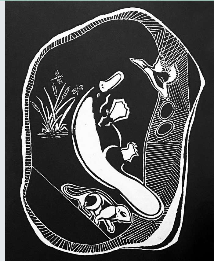
Artwork by Uncle Vic Chapman